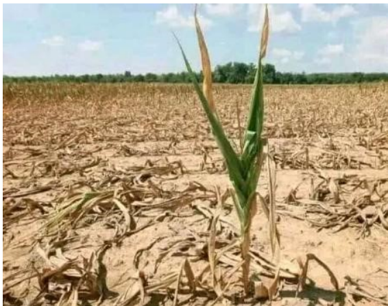
An image of food insecurity in Zimbabwe. Country wide devastation of crops is contributing to famine and increased risk of disease

Mjo McCarthy, our human dynamo, is prepping for her 24 hour endurance event at White Lake State Park in Tamworth May 4th/5th. She is using this run to raise funds to benefit both PKZ medical and food security projects in Zimbabwe. Most of us can't stay awake for 24 hours never mind complete many, many three mile loops of trail running. Mjo's goal is 100 kilometers or 21 loops for 63 miles! I am in awe of Mjo's motivation, discipline and perseverance.