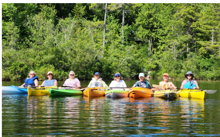
Kayaking on Pine River Pond