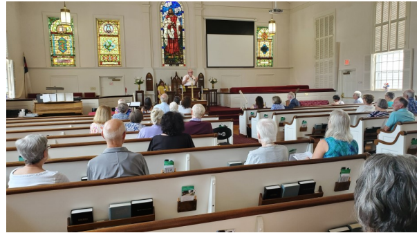
A well-attended 2024 Annual Meeting

There was a presentation on the budget for the upcoming year and we voted to approve it. We were updated on the Search and Call for a settled minister, the status of the Endowment Fund, and heard a proposal for improvements on our sound system. It was an uncontentious and productive meeting and we went forth with blessings into the new fiscal year.